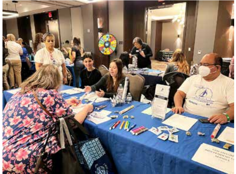
SAILS Staff had a great time at the Low Vision Expo

It was a fun experience and we all had a great time too!