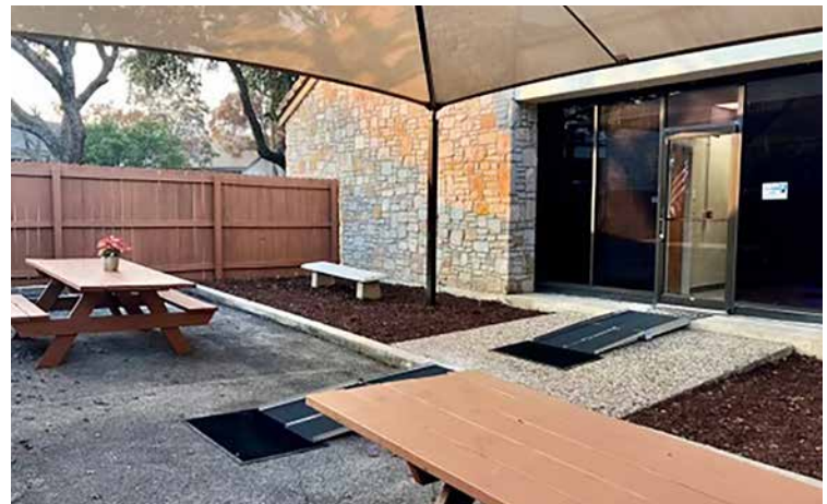
Courtyard after the beautification by Clifton Massey