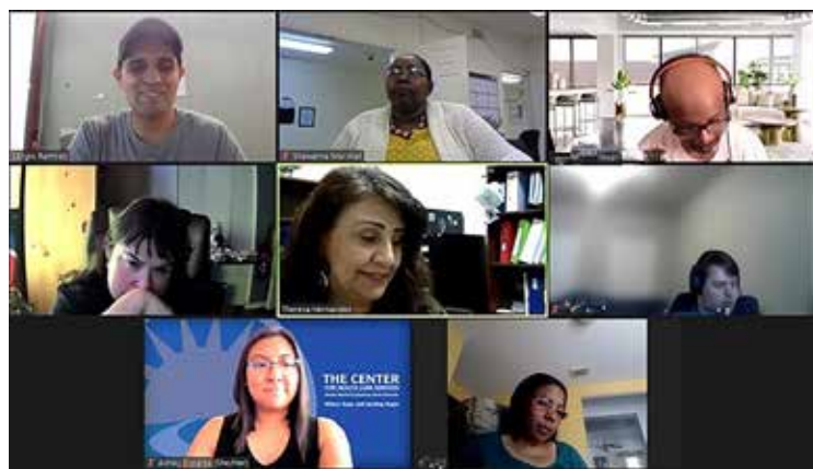
SAILS Support Group Meeting Goes Virtual