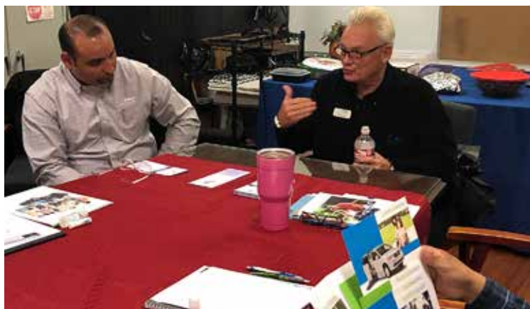
Presentation at SAILS from MobilityWorks