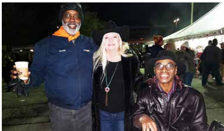
SAILS CEO and Board Members enjoy networking at the San Antonio Rodeo Cowboy breakfast