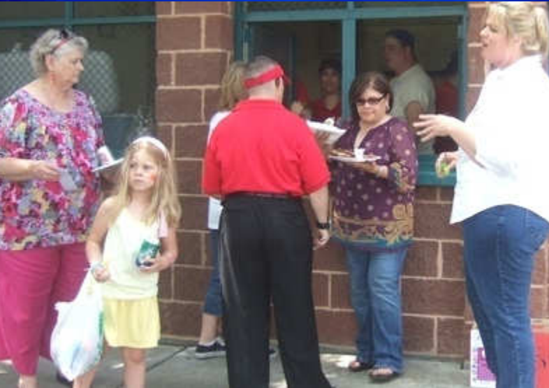
BBQ line at 2009 SAILS Mayfest Picnic