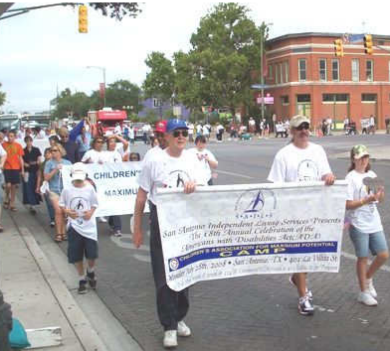
Unity Pride Stroll celebrating ADA