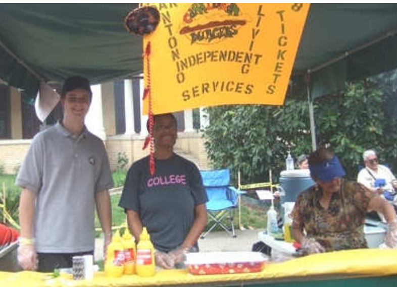
Volunteers at SAILS booth, King William Fair