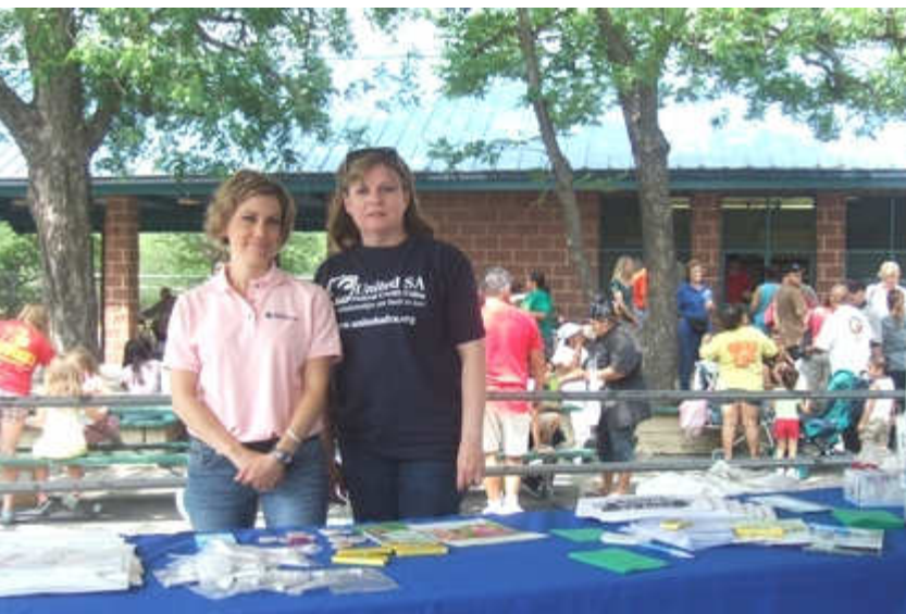
USAA Federal Credit Union's booth

Of course, the "big kids" had a wonderful time too. Several people participated in this year's Silent Auction receiving items such as gift certificates, a clock and giftware. The picnic wrapped up with three entertainment groups: The Harris Power Trio, featuring Mia, Dreams Fulfilled Through Music, and Fascinating Rhythms. SAILS staff thanks everyone involved.