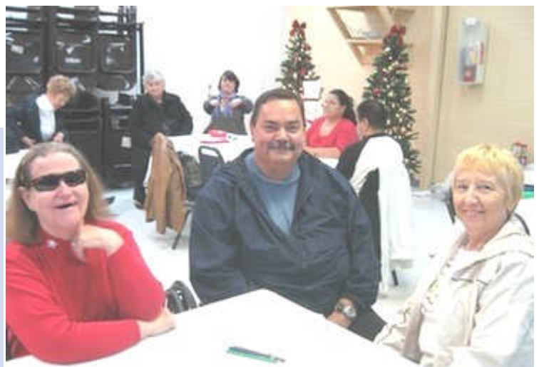
2009 Support Group Christmas Party