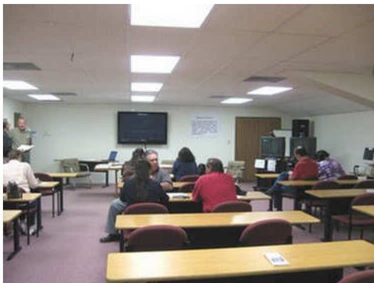
SAILS Staff conducts a very successful W.I.S.E, October 23