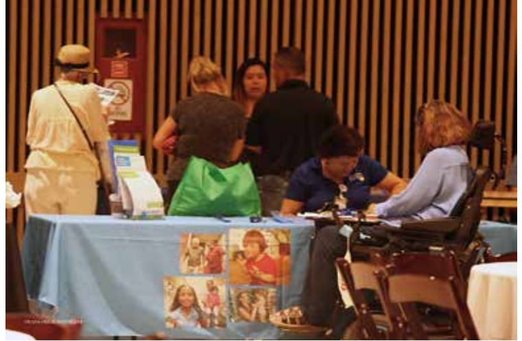
ADA guests visiting exhibits