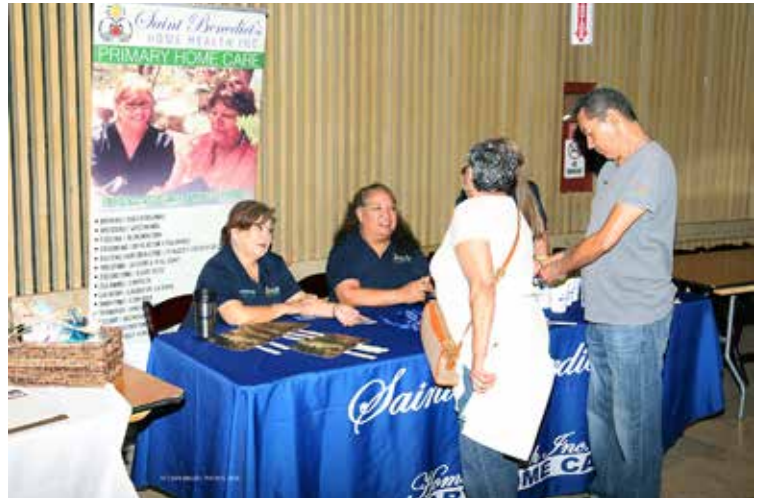
Saint Benedict's Home Health