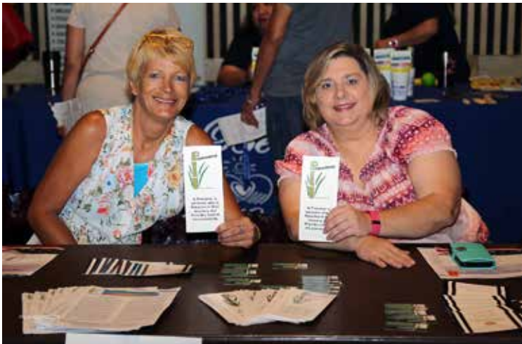
The Ladies from Prosumers