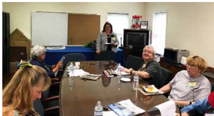
SAILS Peer Support Group guests learn the basics of budgeting

She spoke to the consumers on approaching their creditors and asking for a lower interest rate, work sheets were given to help them track their spending habits.