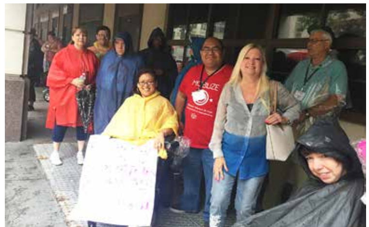
Despite the rain, the march to our Nation's Capitol grounds went on as planned