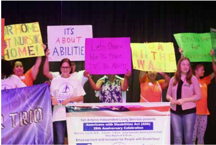
ADA Pep Rally!