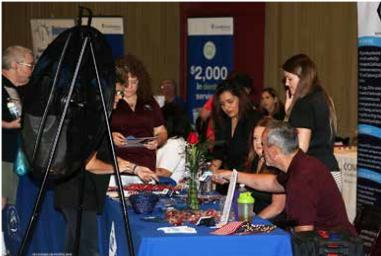
Deaf Interpreter Services Exhibit