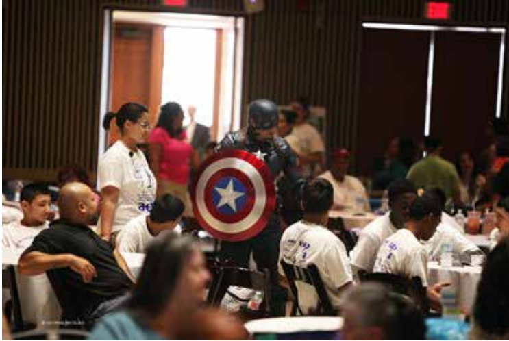
Captain America arrives to Meet the ADA Guests