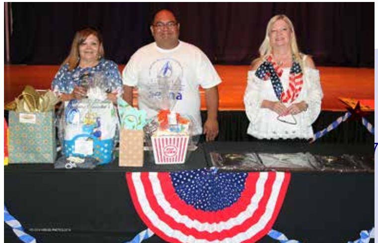
SAILS staff at Awards & Prize table