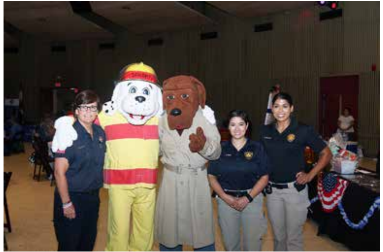
Attendees enjoy meeting mascots from different organizations