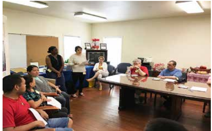
SAILS Support Group Meeting: members learn how to cope with anger

Master's Degree Students from The University of Texas at San Antonio Sarabia Family Campus Counseling Center came to San Antonio Independent Living Services (SAILS) to present information to the Support Group members about ways to cope with anger.