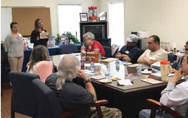
SAILS Support Group Meeting: a presentation by Jefferson Dental Care