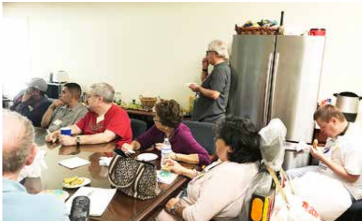
Terra- Genesis company is participating in SAILS Support Group meeting