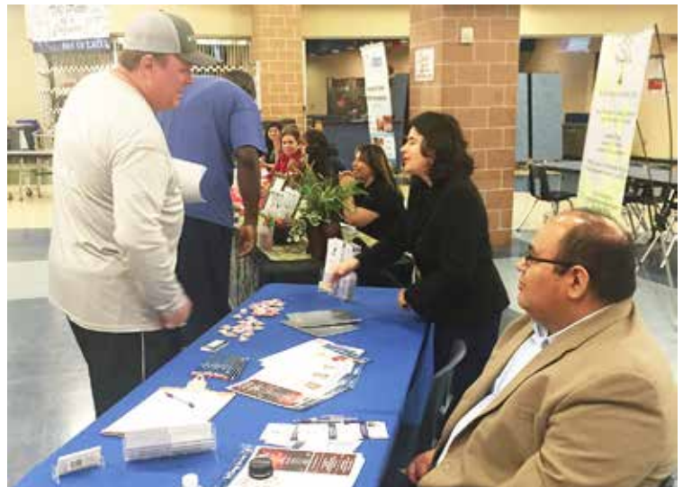
SAILS is at Johnson High School Resources Fair

Parents stopped by the SAILS booth and asked many questions about SAILS programs for their students and were pleased to learn about the resources available.