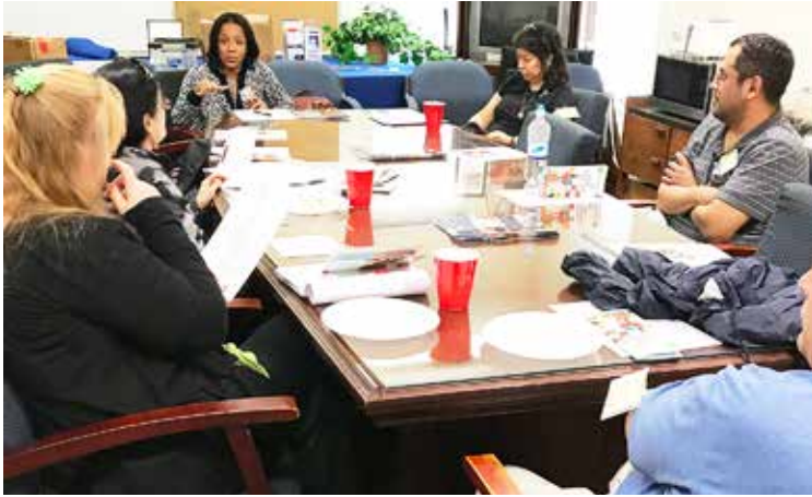
Support Group Meeting: a presentation by members of Texas Work Force Commission