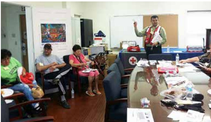
Regular Consumers Support Group meeting at SAILS