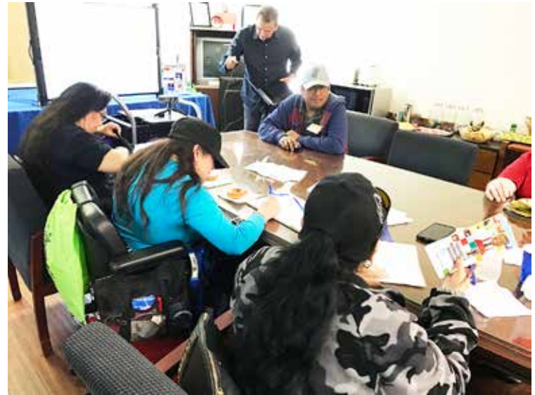
A Successful Support Group meeting for consumers of SAILS