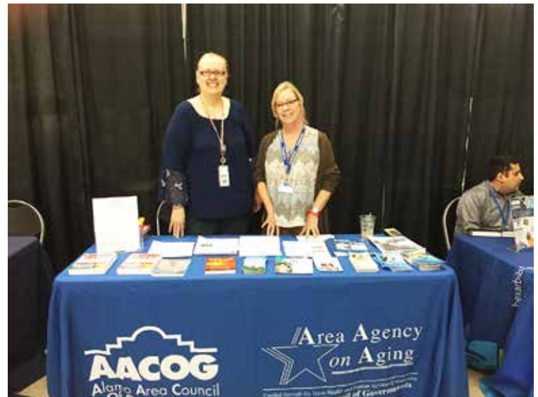
SAILS Staff attended the 20th Annual Low Vision Expo

There were many exhibitors besides SAILS such as the San Antonio Lighthouse for the Blind, Texas Workforce Solutions, Aetna, Alamo Area Council of Governments, Low Vision Resource Center and many, many more. The event was extremely well-attended and a grand success. SAILS staff proudly participate every year!