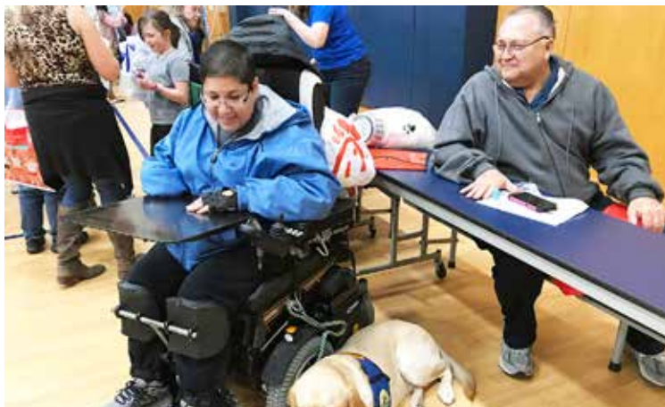
SAILS is at Hondo School District Resources Fair

The goal is to inform them of the opportunities to have SAILS IL Specialists assist with independent living plans and connect them to community resources that are much needed for their success in transitioning from high school to adult life.