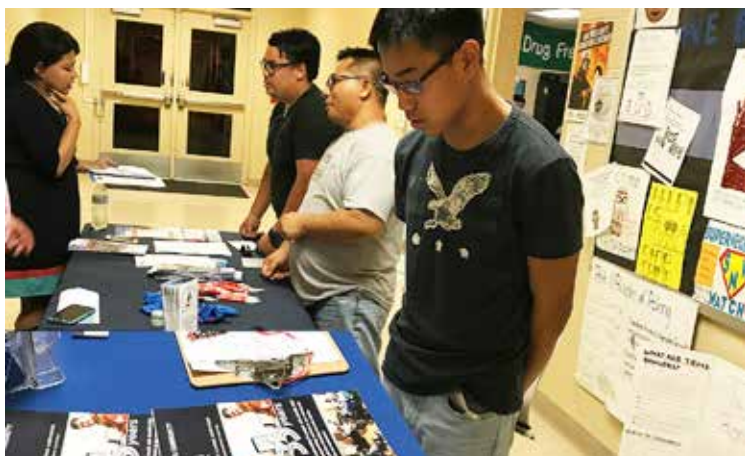
SAILS participates in Southside School District Resources Fair