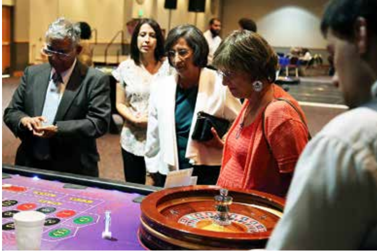
Casino guests having a great time