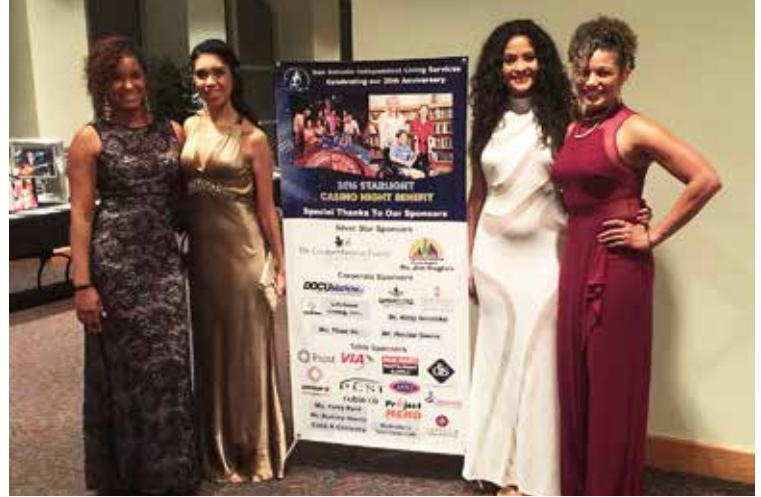
Casino guests from PCSI