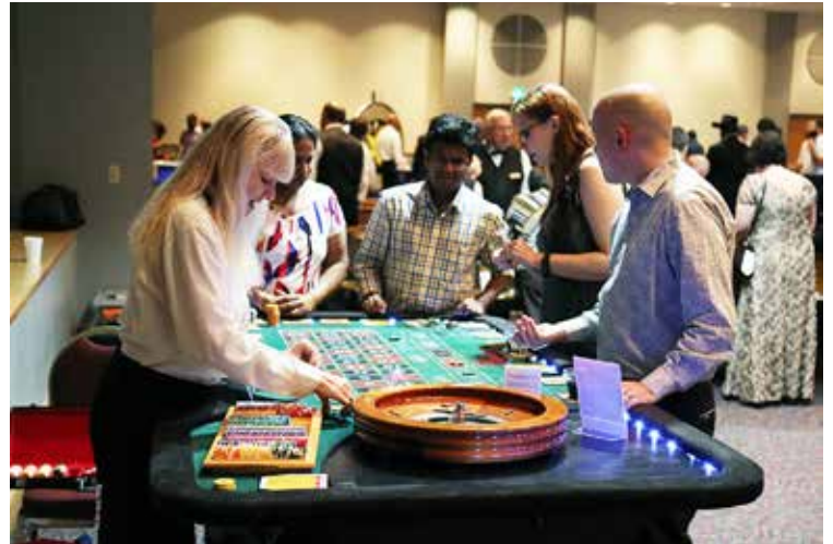
Casino Night guests enjoy playing roulette