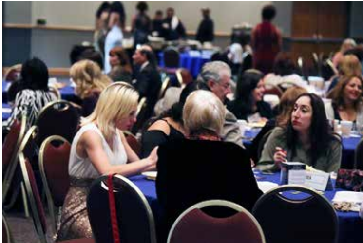
Casino guests enjoy the cuisine