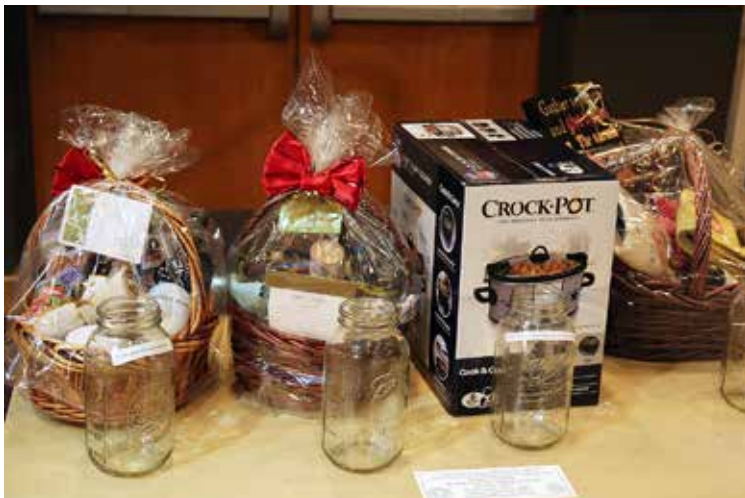
Casino Night prizes for drawings