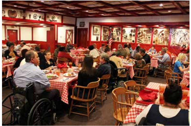
Volunteers luncheon, 2016