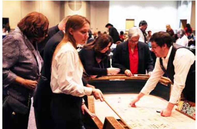
More Casino fun