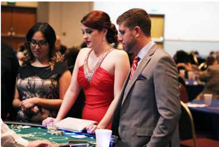
The ladies love Casino Night!