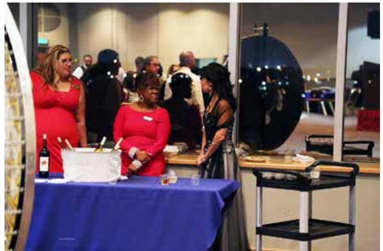
SAILS Casino Night volunteers