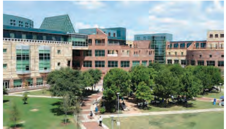
San Antonio Independent Living Services to host 26th Anniversary ADA Celebration, July 23rd, 2016 at UTSA Downtown Campus

This a FREE event and everyone is welcome to attend. For information regarding how to register as an exhibitor or to attend please call 210-281-1878 extension 118.