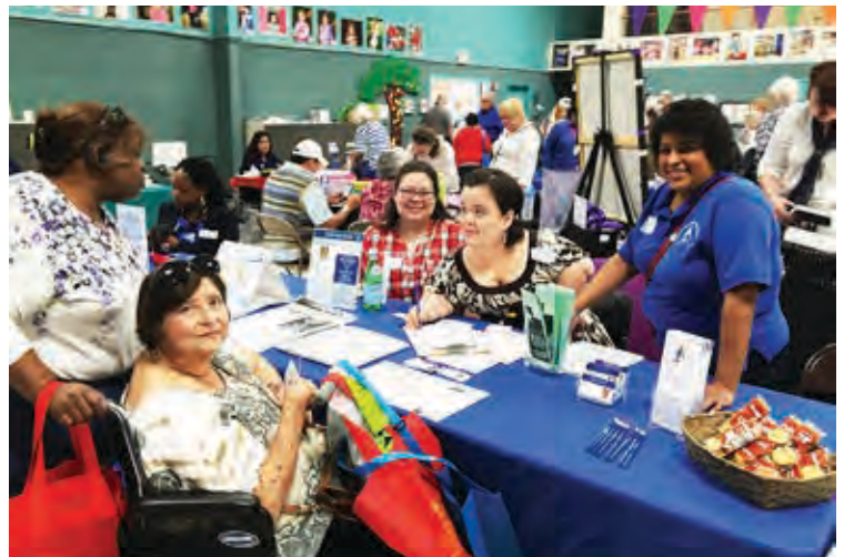
SAILS Staff is at Low Vision Expo to provide information on services and programs that SAILS offers to the public

The Low Vision EXPO is an annual event that shares the latest low vision aids and technology for persons who are visually impaired, blind or seniors who need the resources. There were large number and talking clocks, magnifiers and talking watches and more! Besides SAILS, The San Antonio Lighthouse for the Blind, The Low Vision Resource Clinic, Alzheimer's Association, Alamo Council for the Blind, Lions Low Vision Center, Amerigroup Real Solutions, Texas Talking Books and many others were exhibitors. SAILS looks forward to participating again next year.