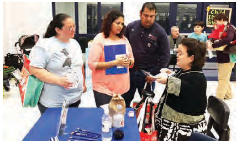
SAILS staff attends Hondo Highschool Transition Fair

Hondo High School's Transition Fair was a great success because there were so many resources available to assist the students and their parents. I really enjoyed meeting the students and family members who stopped by the SAILS booth. Everyone seemed very interested in what staff can do to help with transition. I explained that transition is different for every student because each person needs their own individualized plan. SAILS staff is available for helping the student develop their transition plan.