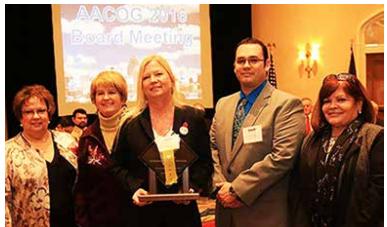
SAILS receiving 2015 Regional Community Award