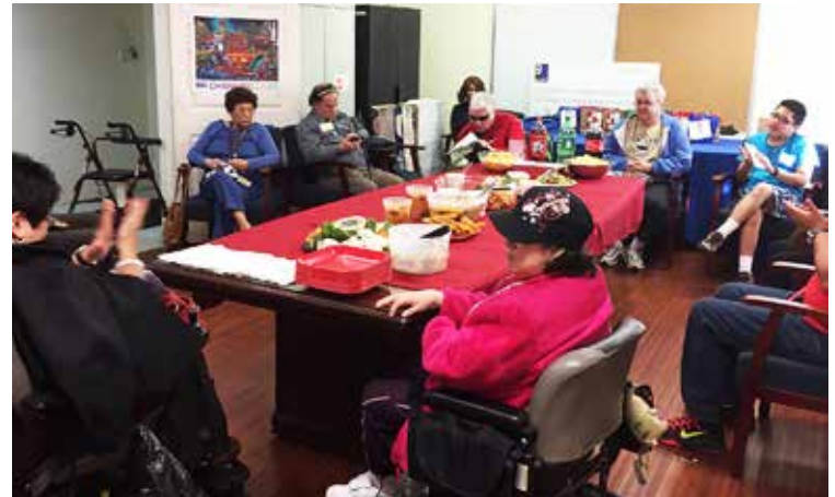
Support Group members enjoy holiday party, December 2015