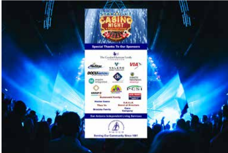
"Thank You" to all sponsors of the Starlight Casino Night