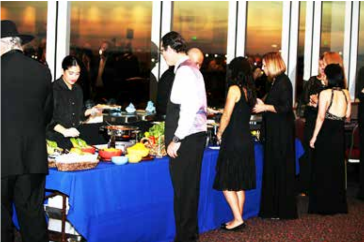
Lupe Tortilla staff serves food at event