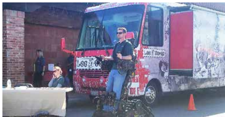
A mobility demonstration at Access Ability Fest

The exhibitor across from us was with Action Trackstander which featured an action trackchair that enables a person who uses a wheelchair to stand. It was really amazing to watch the demonstration. SAILS staff always have fun and look forward to attending and supporting this large accessible community-wide event.