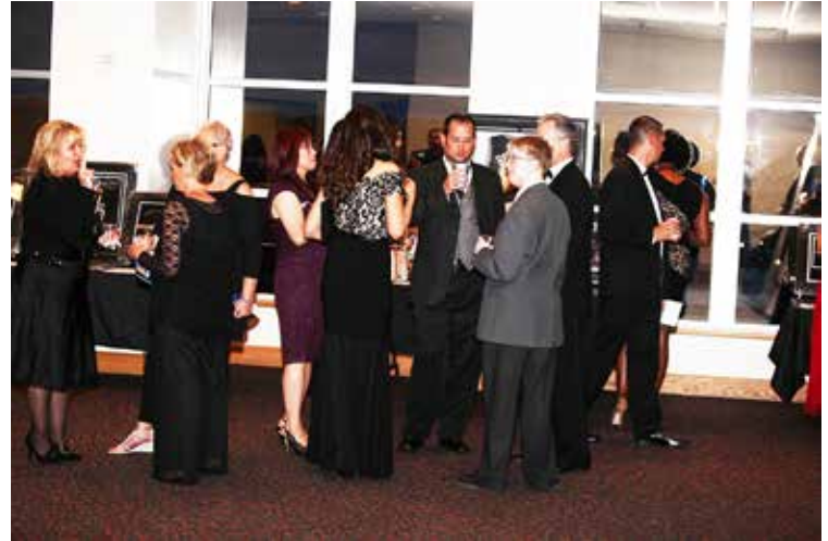
Guests arriving at Casino Night