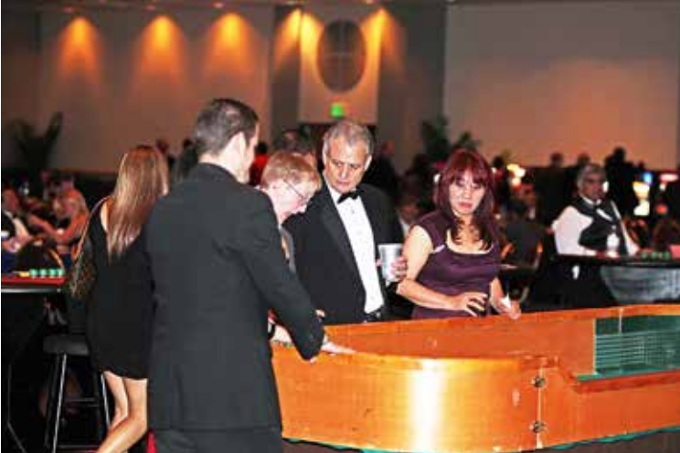
Guests at Roulette