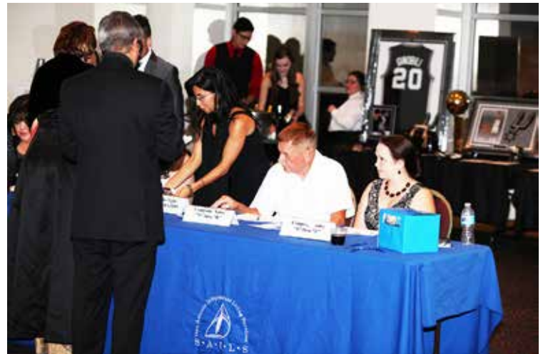
Casino guests register