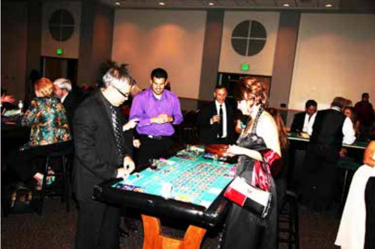
Guests at a game table