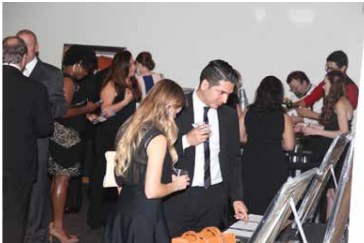
Guests checking silent auction