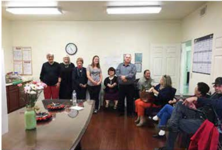
Board Directors, Staff and Consumers at SAILS 2015 Openhouse

Everyone enjoyed visiting with each other and the tasty refreshments. I would like to extend a special thanks to the SAILS staff who helped out with the refreshments and greeted guests and a warm thanks to everyone who took the time to stop by and visit!