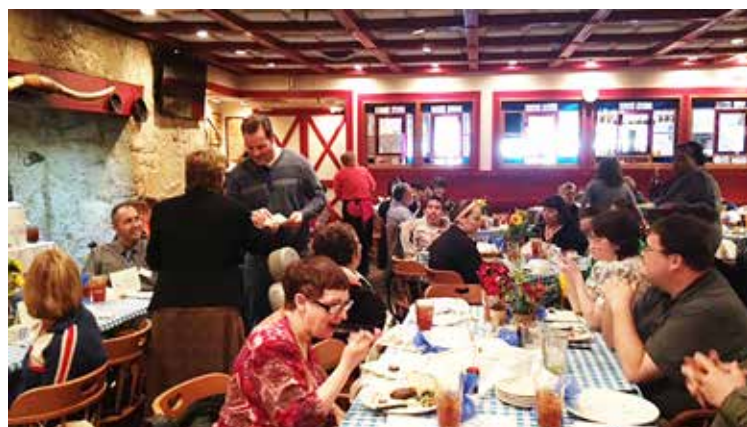
2014 SAILS volunteers and guests at the Appreciation Luncheon

2015 Fiesta Resource Fair April 25, 2015