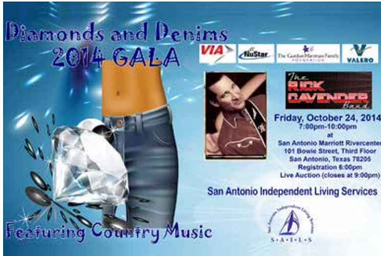
2014 SAILS Diamonds and Denims Gala Poster