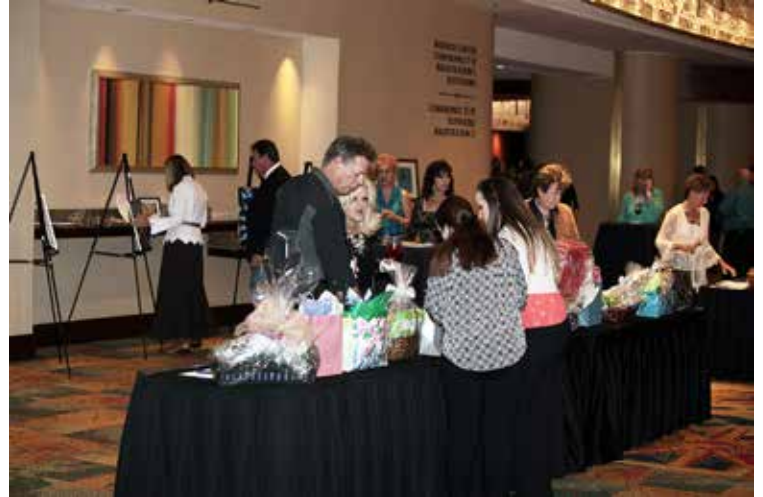
Shopping for Auction items