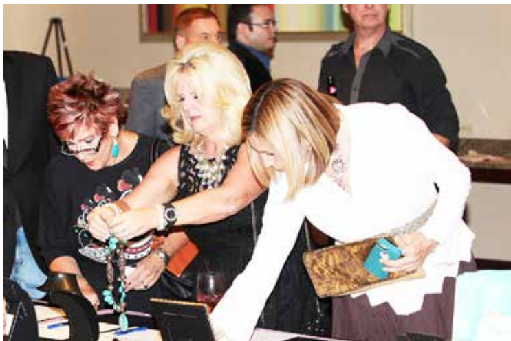
Auction items for bidding