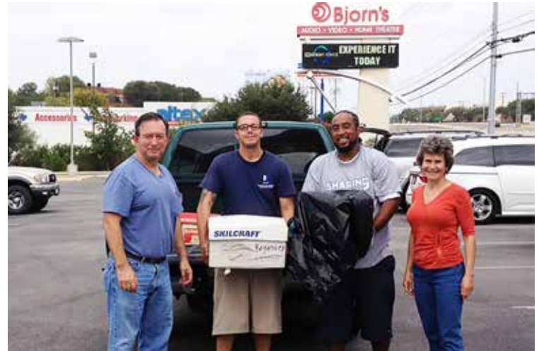
Goodwill employees and volunteers at "Stuff The Truck", a SAILS fundraiser event in partnership with Goodwill and Bjorn's

Goodwill Industries makes a good community partner for nonprofits like SAILS. Goodwill's Partners for Good Program is one way to raise awareness and raise funds. On September 14, 2014 SAILS organized and gathered together large bulky items, clothing, toys and may more items at Bjorn's on highway 281 to be donated to Goodwill Industries. SAILS tagged this fundraiser our "Stuff the Goodwill Truck!"