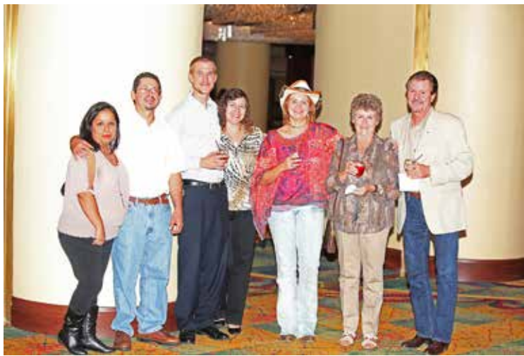
Alamo Mobility's guests enjoying the Gala