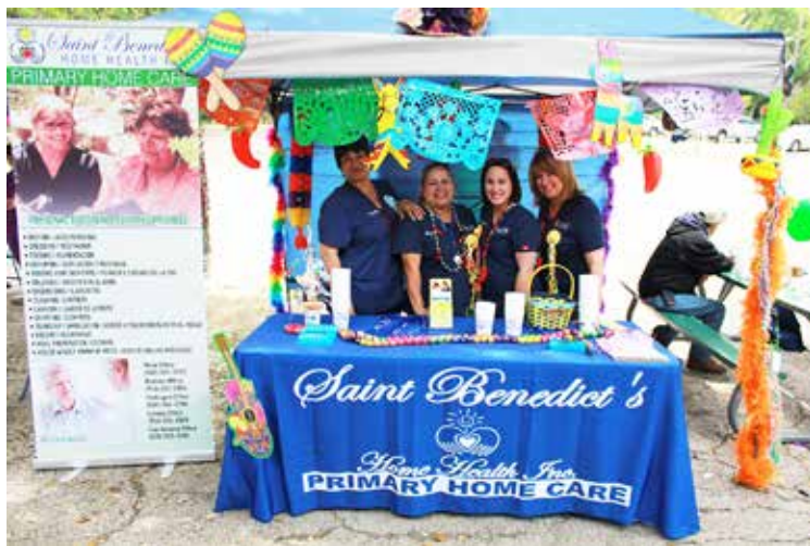
St Benedict's Primary Home Care