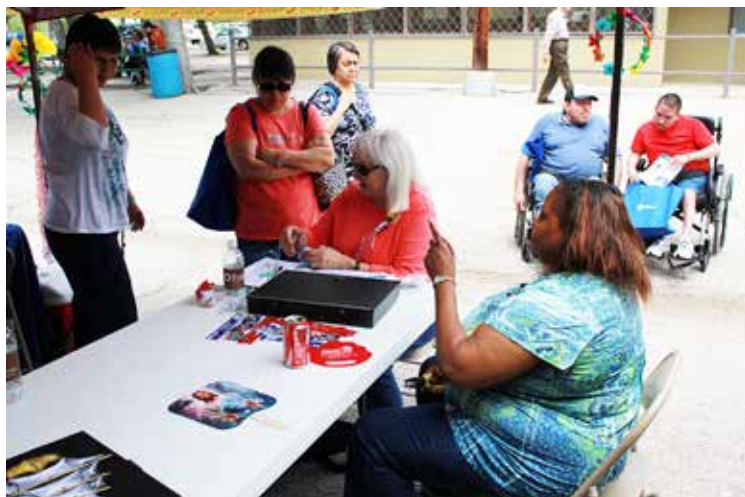
SAILS staff members meet and greet guests