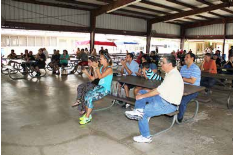
Guests Enjoying the Bands