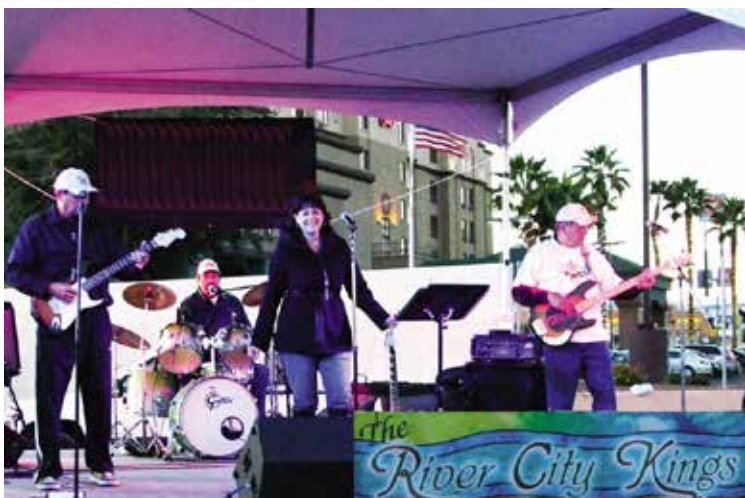
The River City Kings Band