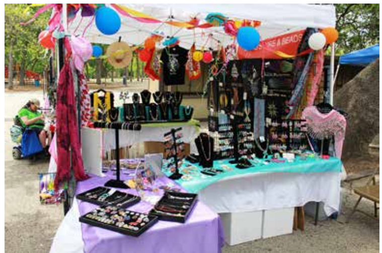
Barb's Wire & Beads